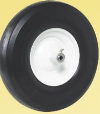
16" Wheel Smooth Tread (roofers)