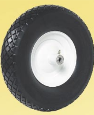
16" Wheel Diamond Tread (construction)

Microcellular Polyurethane Tires provide a soft, air-cushioned ride. Each tire is made of hundreds of microscopic air cells trapped in a matrix of incredibly tough polyurethane. The result is a tire that is amazingly lightweight, incredibly durable and significantly easier to roll.