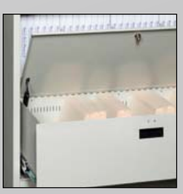
Confidential Files & Equipment