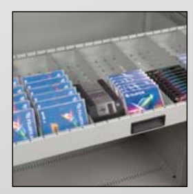
Computer & Video Cartridges