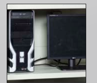
Sensitive Data Equipment